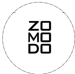
Stamped Logo detail